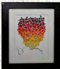
Diane Thornton "Pele Dreams" 325.00