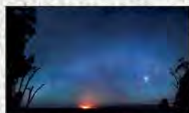
"201112100439 Total Lunar Eclipse" 125.00